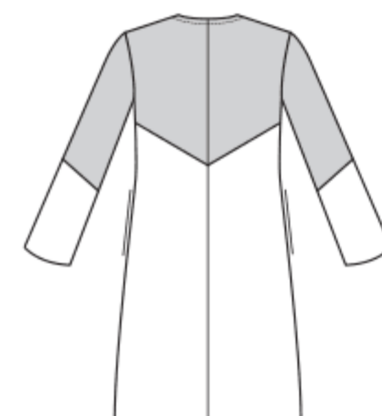
Back A and B