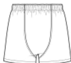
DOS - BACK